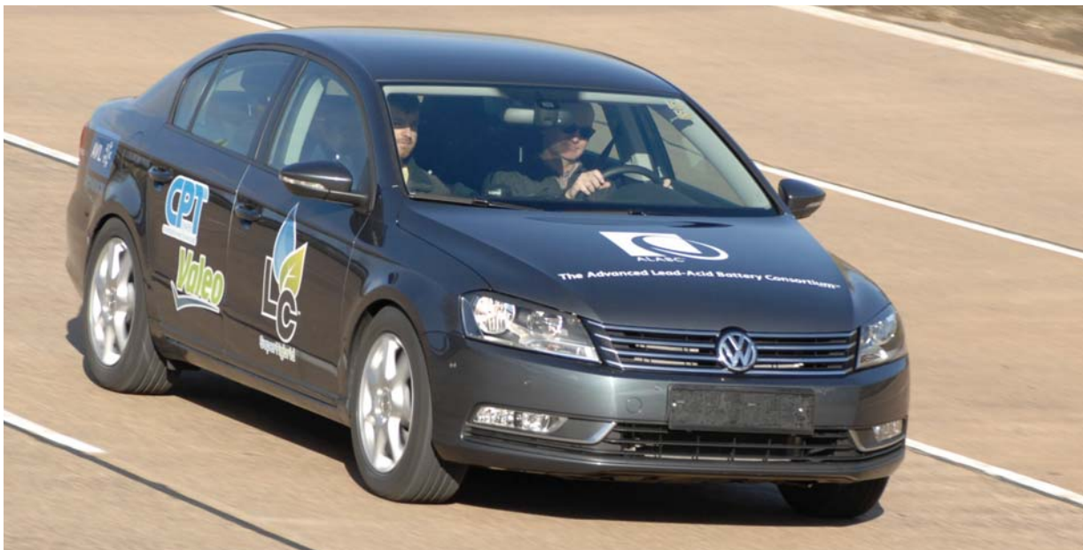
The LC Super Hybrid undergoes testing

Improving Performance, Reducing Environmental Impact